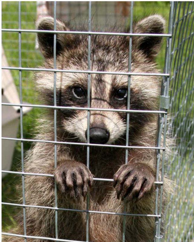
We need lots of help with building cages

If anyone would like to help with various aspects of fundraising—coordinating donation boxes, developing promotional materials, writing grant applications, approaching potential suppliers, or organizing events—we would greatly appreciate your help. ❖