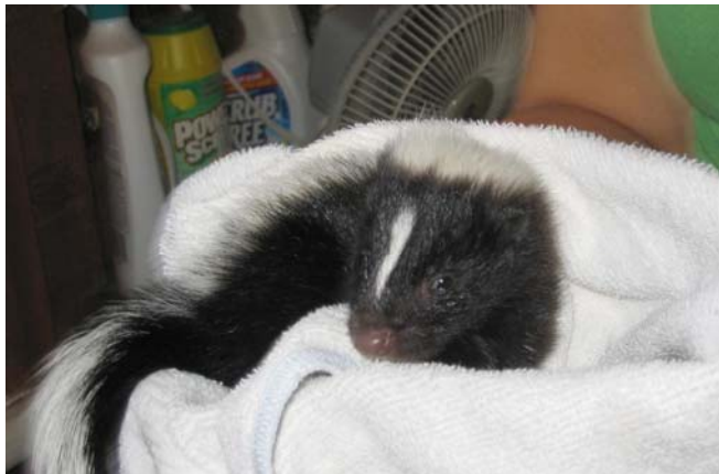
One of four baby skunks (mom was hit by a car)

Without the support of our incredible volunteers, we would not have been able to help as many animals as we have. Every single one of our volunteers deserves specific mention for some way they went “out of their way” to help, whether that be their dedication and dependability, the number of hours worked, doing the grunge work, buying much needed supplies, dealing with the heat waves and insane mosquitoes, and even getting spouses involved.