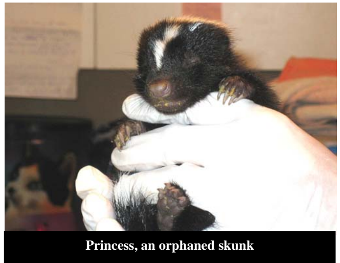
Princess, an orphaned skunk

Call us or visit our website to find a rehabilitator and instructions on what you should do when you find orphaned wildlife. ❖