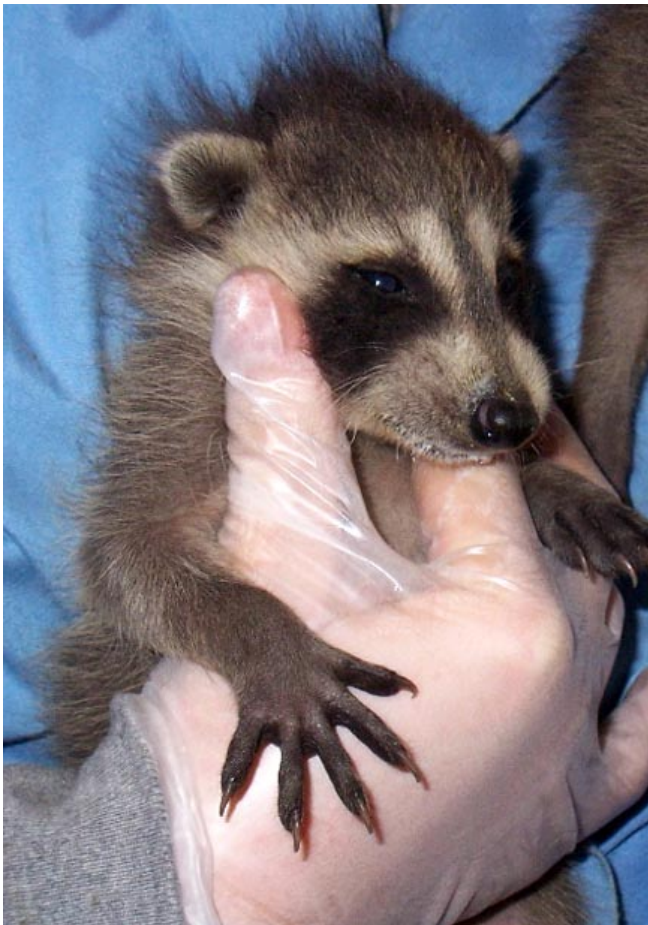
One of our spring orphans

Firstly, it is illegal for the public to care for wildlife. Secondly, many wild animals that need rescuing are dehydrated and in shock and feeding them anything in this condition can be life-threatening—they cannot process food in this state. Thirdly, mammals have a very different diet than humans and cannot tolerate what you would typically find in the fridge (e.g. cow's milk). Lastly, but most importantly, feeding a baby animal any liquids without knowledge of the proper feeding techniques can result in aspiration (breathing fluid into the lungs).