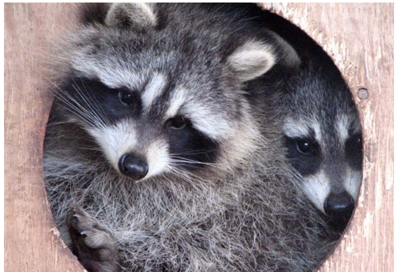
Two of our cozy, overwintering raccoons