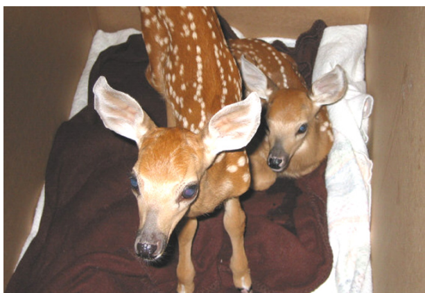
Our two foster deer