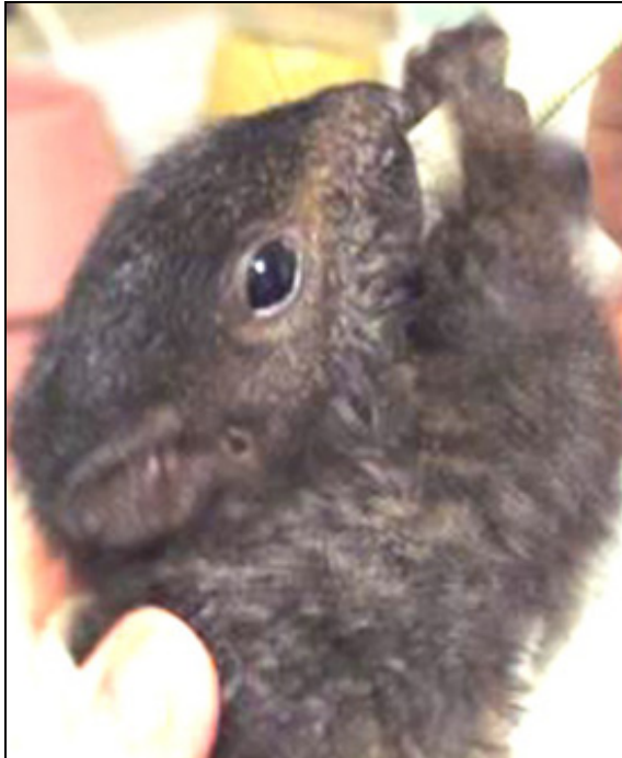
Formula feeding a juvenile squirrel