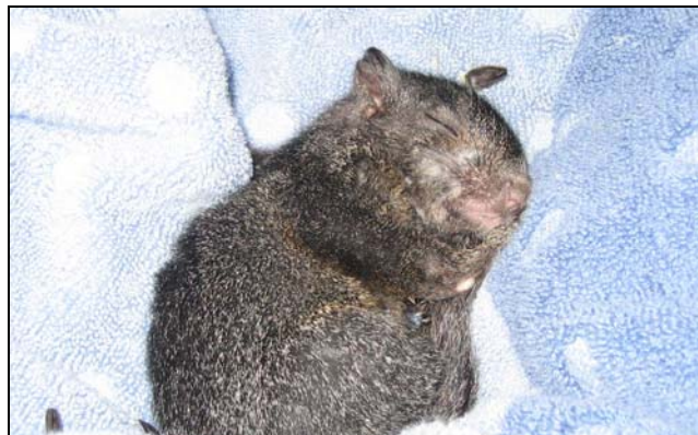
Nutter, who was injured in a fall from his nest

We are always looking for in-center volunteers to help with feeding orphaned wildlife and other fun stuff such as laundry, dishwashing, cage cleaning, etc. Animal care assistants are asked to commit to a consistent schedule for a minimum of four hours per week for three months. Most of the animal care occurs between April and October. Weekday volunteers are particularly needed. We arrange the volunteer schedule in February so be sure to call us early in the new year ❖